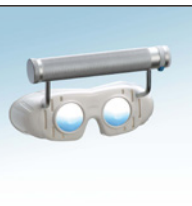
1x Nystagmus spectacles type 523